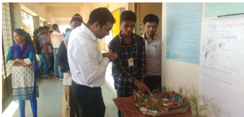
Student participant explaining the model