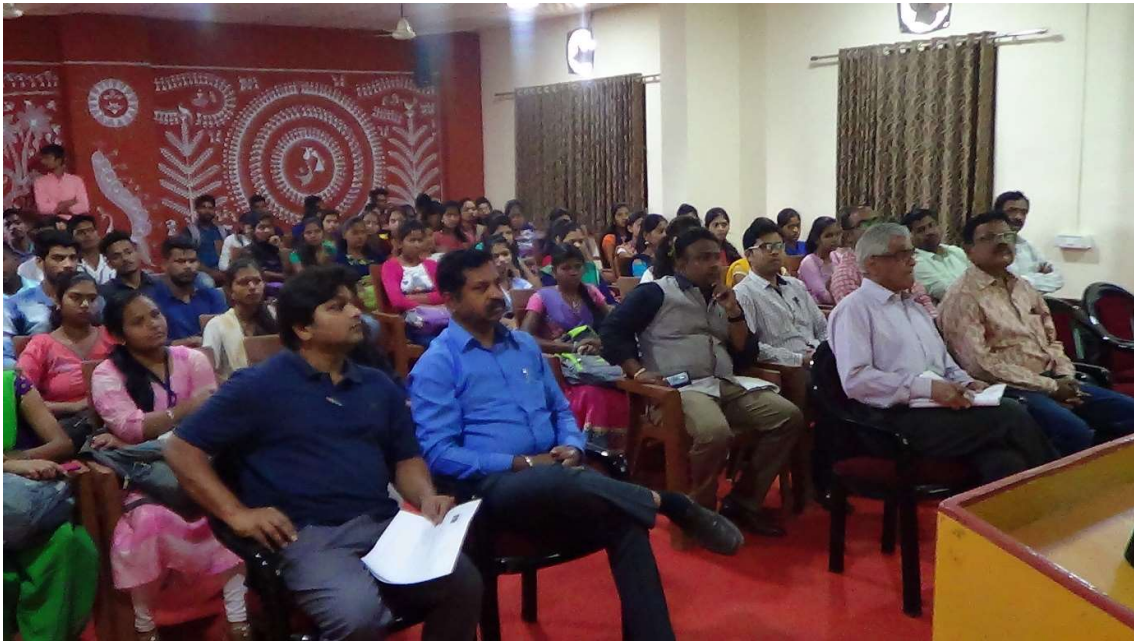
The Participants: Teaching, non-teaching staff and students